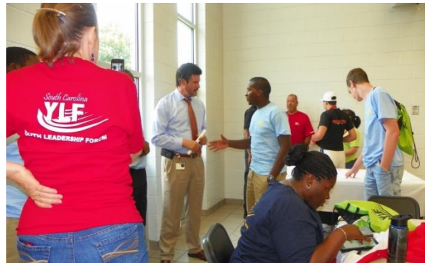
YLF Participants exchange ideas during their annual event.