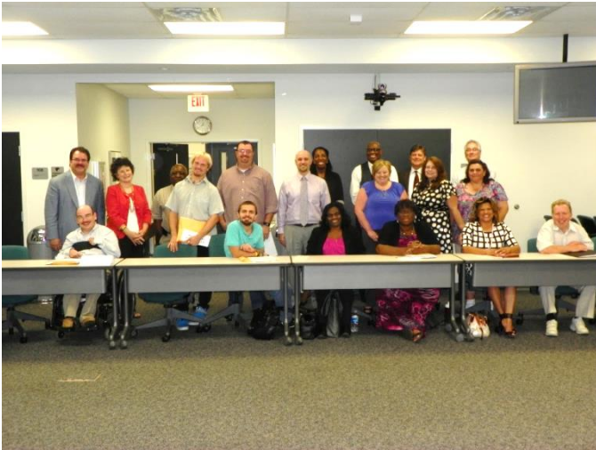
South Carolina Developmental Disabilities Council Members

South Carolina focuses on four priority areas: Community Supports , Employment , Health and Quality Assurance/Self-Advocacy . Each area addresses specific needs as outlined in the Developmental Disabilities Council State Plan. The plan is developed by the council and grants are funded based on specified criteria.